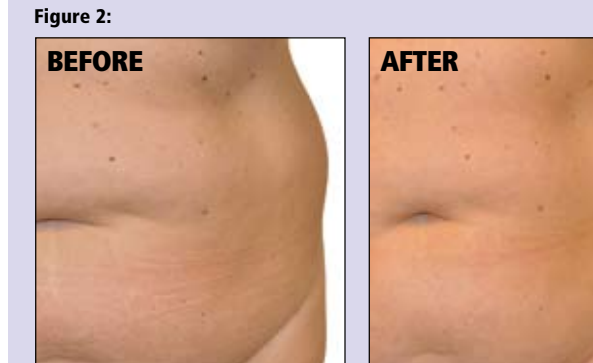
The thickness of the subcutaneous layer may be reduced by an average of 20% after 2–3 months, and even more after 6 months. Further reduction may be achieved with additional treatments.

As with most treatments there are some contraindications including pregnancy, circulation disorders, diabetes, skin infections, dermatitis, cold urticaria, systemic treatment with